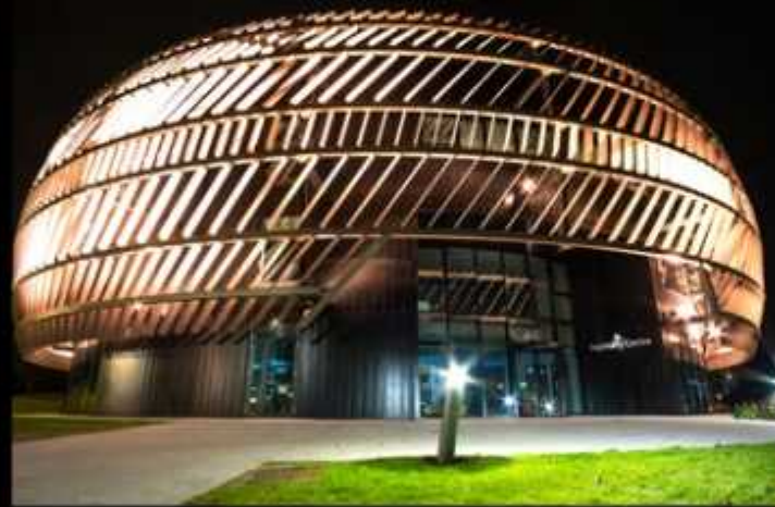
Ingenuity Centre, Nottingham University campus