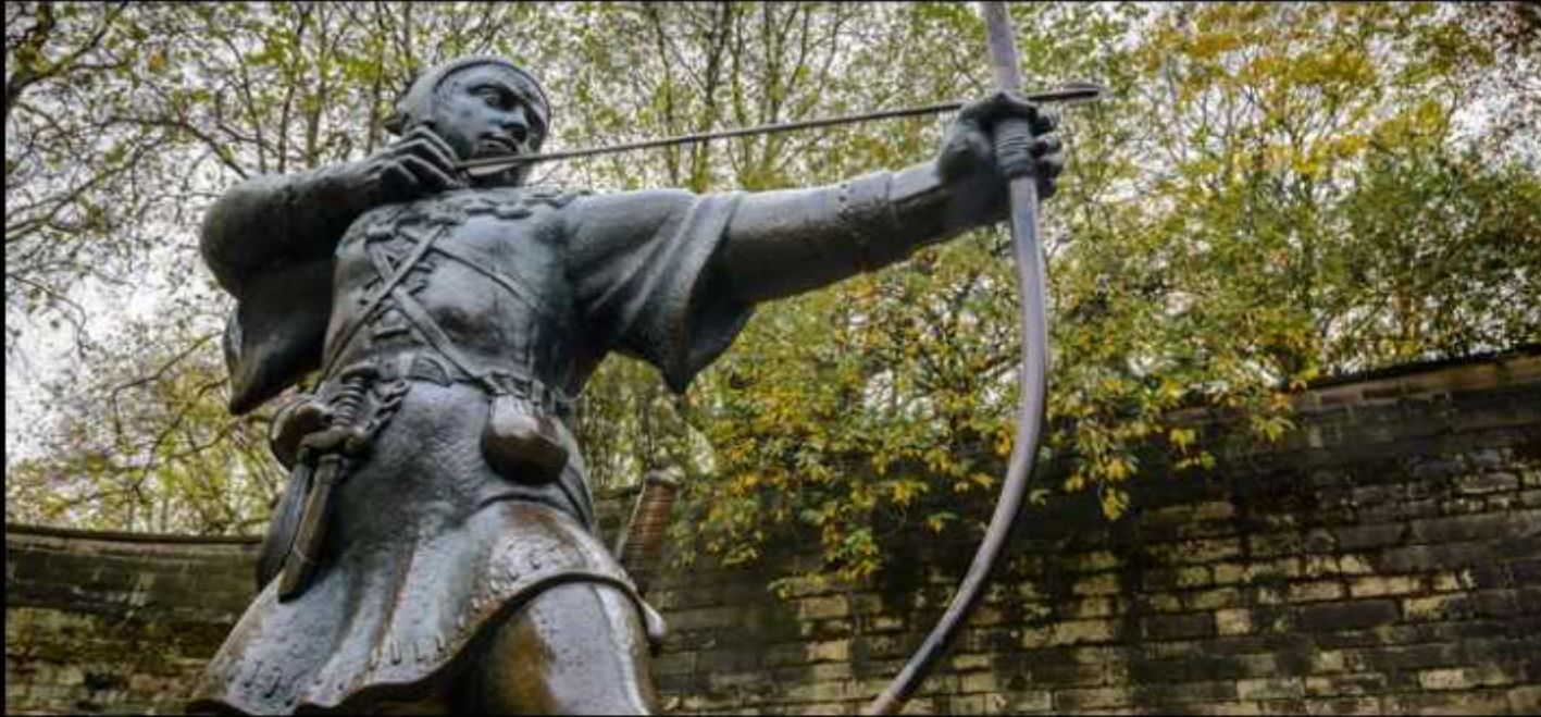
Explore Nottingham's unique history