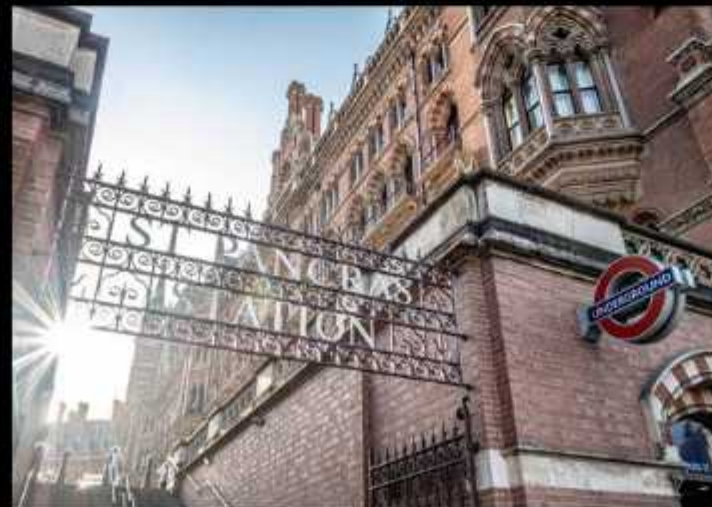
Eurostar Hub, St. Pancras Station