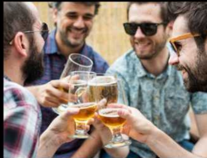
Award winning pubs