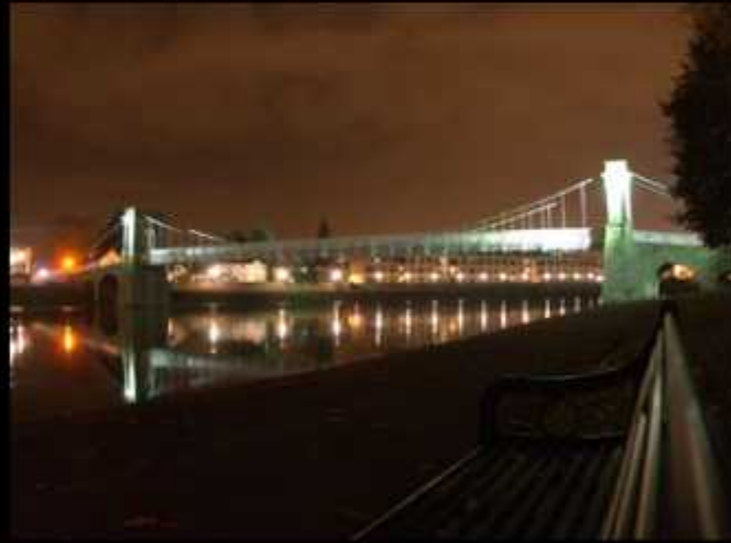
Waterside Living - River Trent