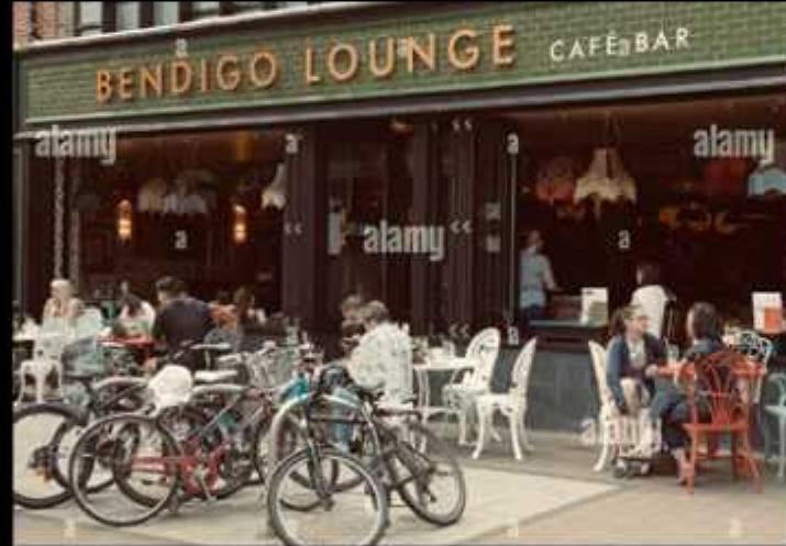
Cafe society at Bendigo Lounge