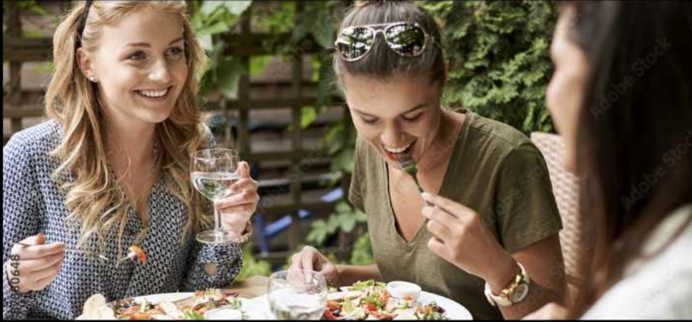
The good life