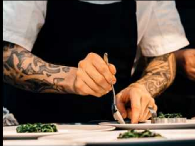
A world of cuisine