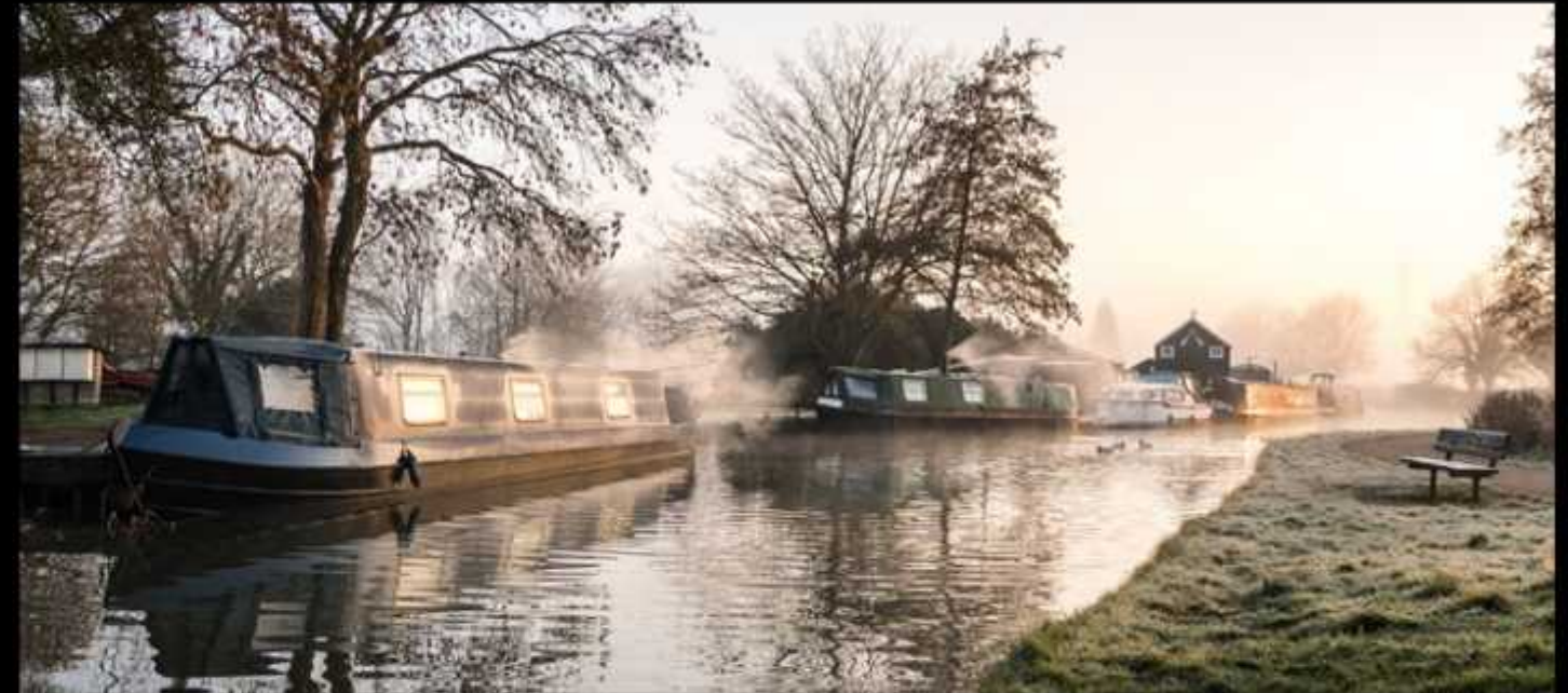
Rich in nature - the River Trent