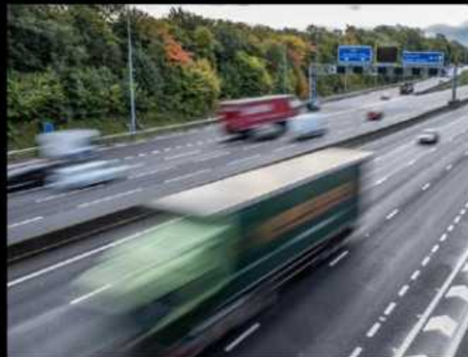
UK transport links