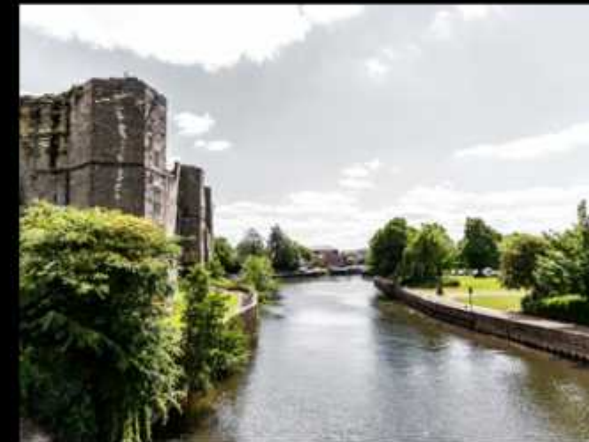
Historical and cultural